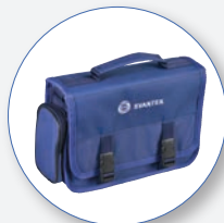
SA47M Carrying Bag Fabric Material