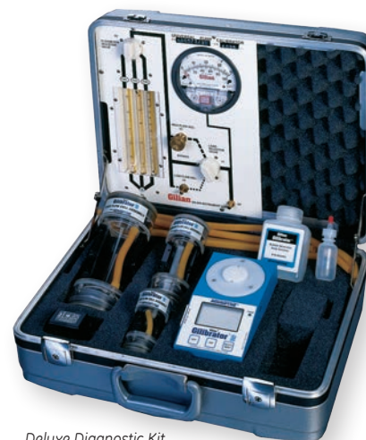
Deluxe Diagnostic Kit