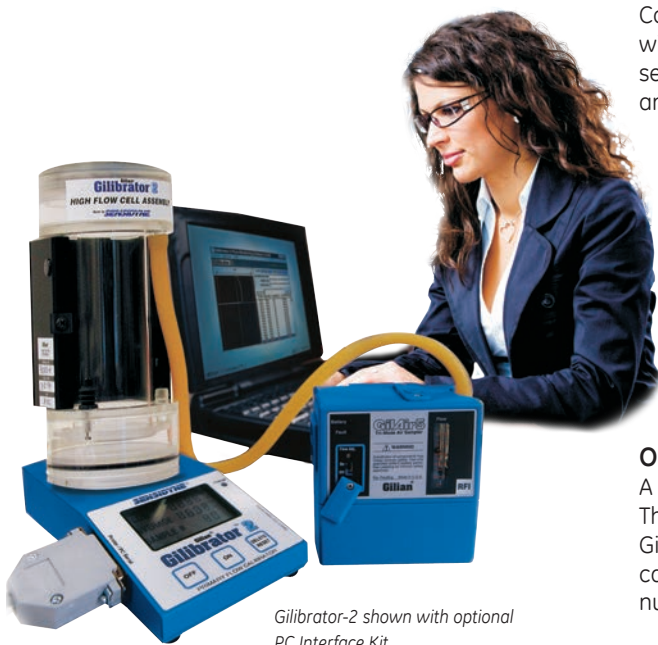
Gilibrator-2 shown with optional PC Interface Kit

A PC Interface Kit is available for real-time data download and manipulation. The kit includes a cable for connecting a computer to the RS-232 port of the Gilibrator-2 Base, as well as software that allows the user to log pump and calibrator serial numbers, data, operator name, flow rates, averaging data, number of samples, sample sequence, and standard deviation data.