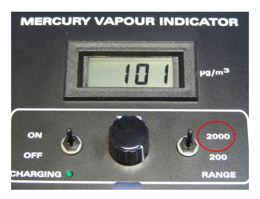
Range: 0-200 μg/m<sup>3</sup>