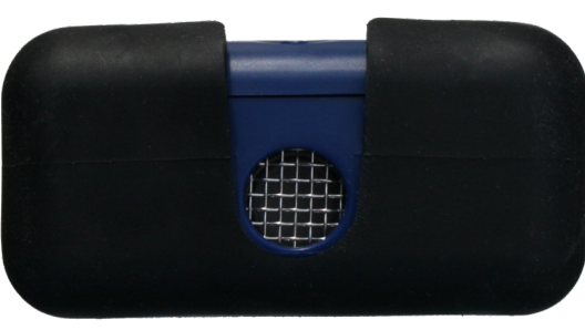
Ruggedized boot and Stand Included