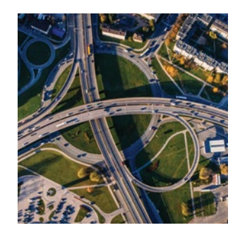
Roads And Highways