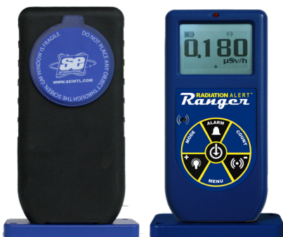
Lanyard, Ruggedized Boot, Detector Cover, USB Cable and Stand Included