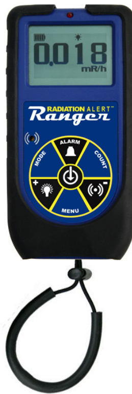
Shown with ruggedized protective boot