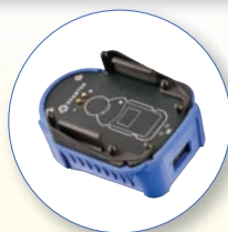
SA104-1 Docking Station for Single Dosimeter