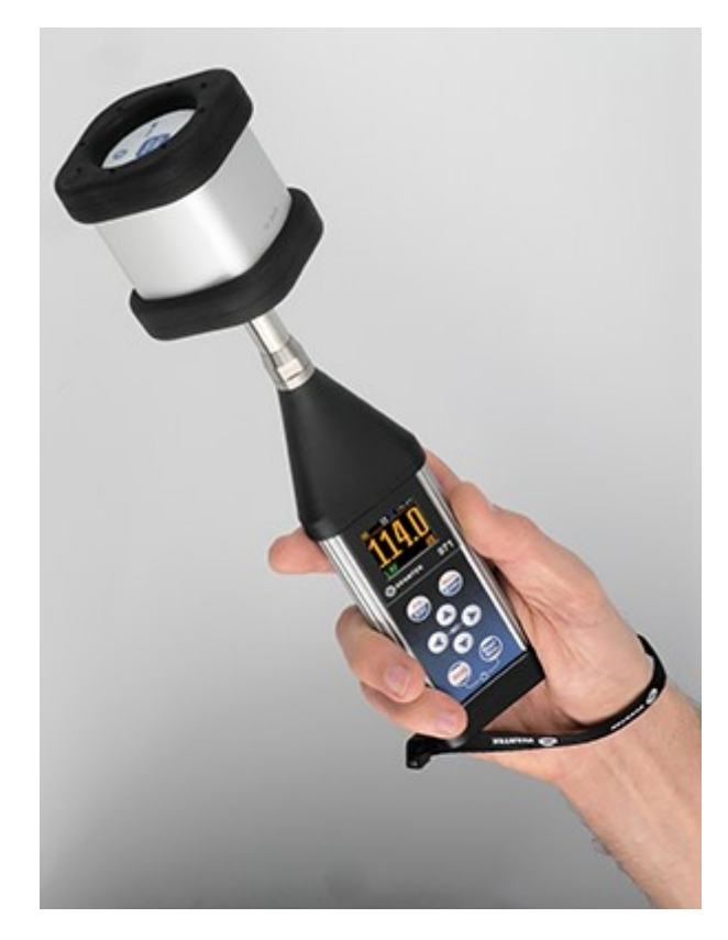
Picture 2. Calibration of the SVAN 971 sound level meter with a 1/2" measurement microphone