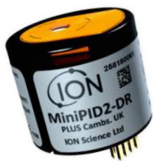
MiniPID 2 sensor