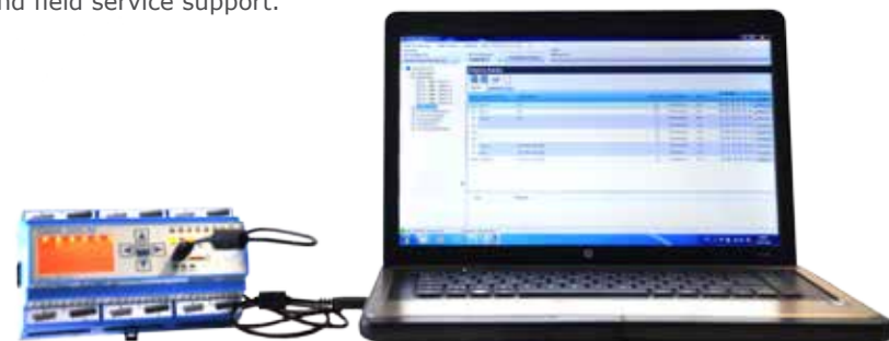
GMA 200-MT configuration via software