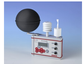
ELR605M / ELR615M: 15 cm diameter black globe sensor