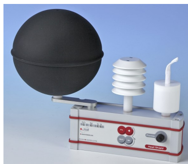
ELR615S: 15 cm diameter black globe sensor satellite modules