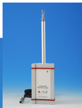
ESV125A Va sensor (hot wire)