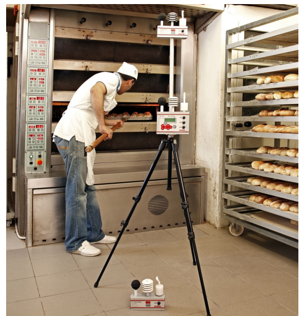
Three levels WBGT on the same vertical