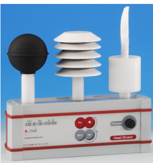
ELR610S: 5 cm diameter black globe sensor satellite modules

The Heat Shield models with radio (ELR610M / ELR615M) can be supplied with additional two wireless satellite modules (ELR610S / ELR615S). The satellite units are used to measure environmental conditions at three positions or levels and calculate Head-Torso-Ankle Weighted Average WBGT. Heat Shield radio can cover up to 300 m in line-of-sight distance, in indoors conditions it may vary.