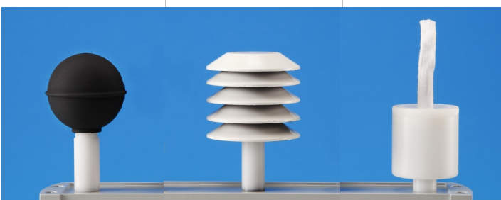
Tg sensor, 5 cm (2") or 15 cm (6") diameter

Heat Shield supports both 15 cm (6") and 5 cm (2") black globes thermometers diameters.