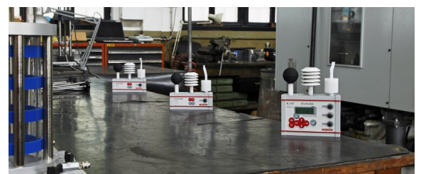
Assesments in three positions of the same environment