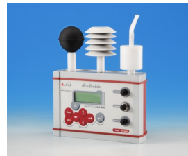
ELR600M / ELR610M: 5 cm diameter black globe sensor

Heat Shield has an algorithm that obtains the temperature of the 5 cm diameter globe (standard according to ISO 7726) starting from the data obtained from the 15 cm diameter globe.